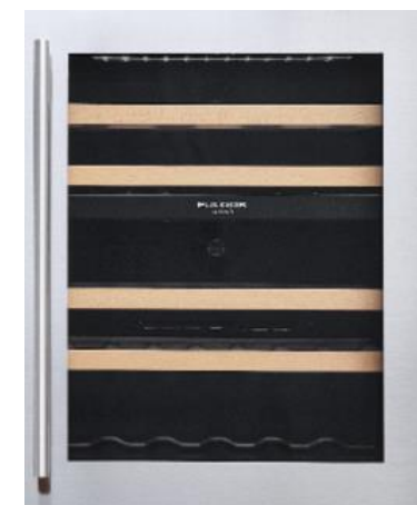
Optional Upgrade $3,500 24" UNDERCOUNTER WINE COOLER