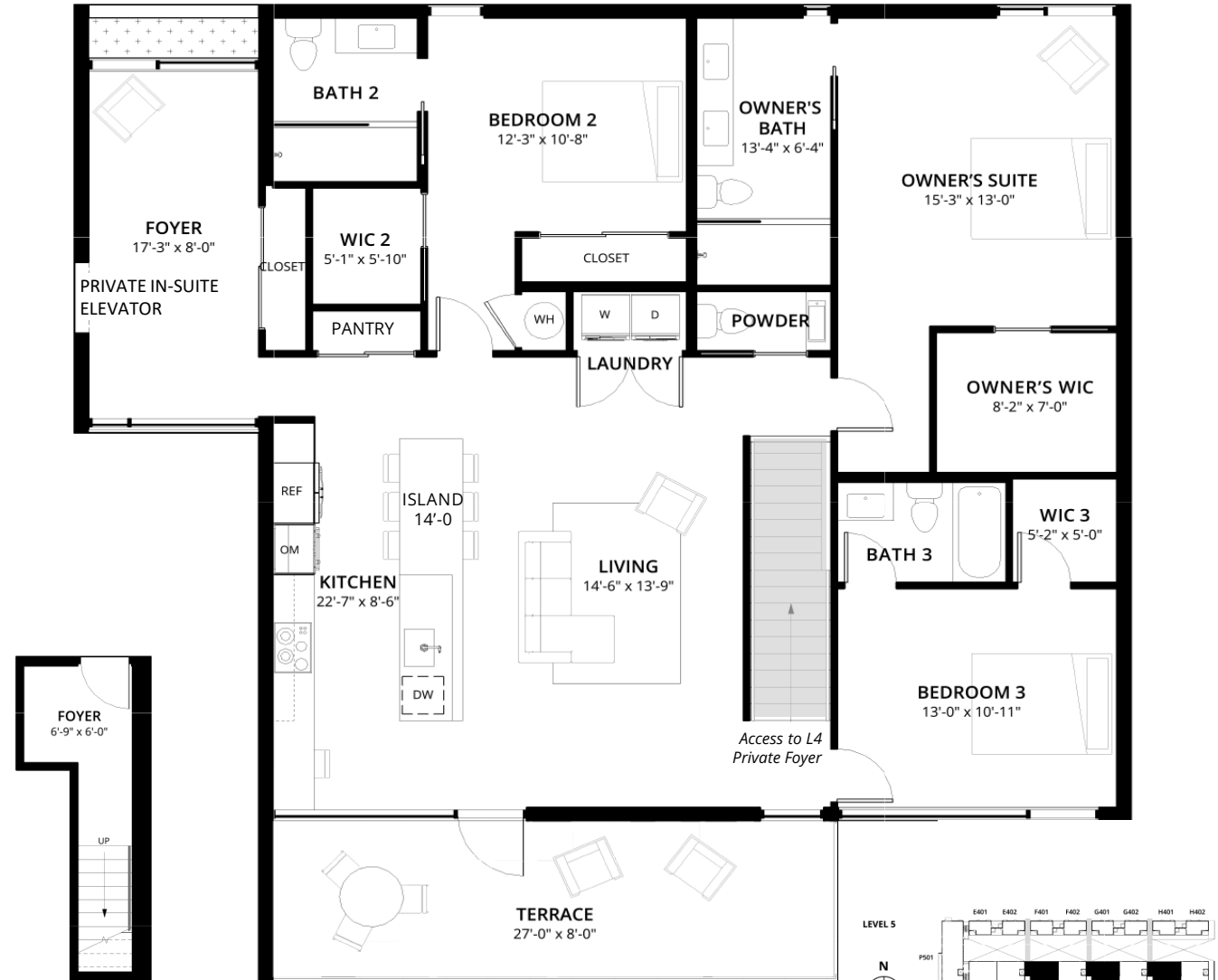
Alternative Private Foyer on Level 4

THE GALLERY'S PICTURESQUE CENTER COURTYARD