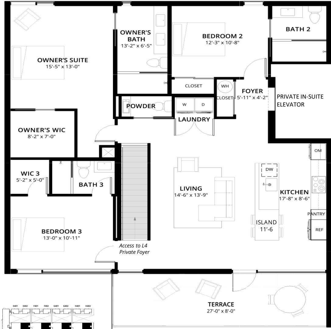
THE GALLERY'S PICTURESQUE CENTER COURTYARD