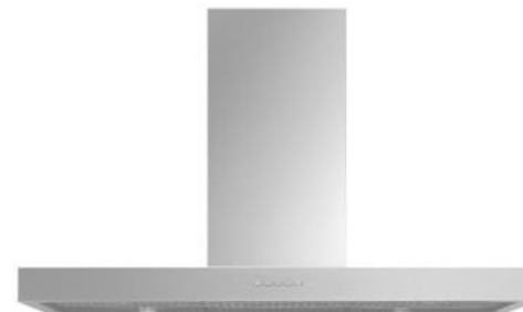
30" COOKTOP WALL HOOD