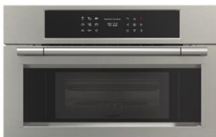
30" BUILT-IN PRO SPEED OVEN