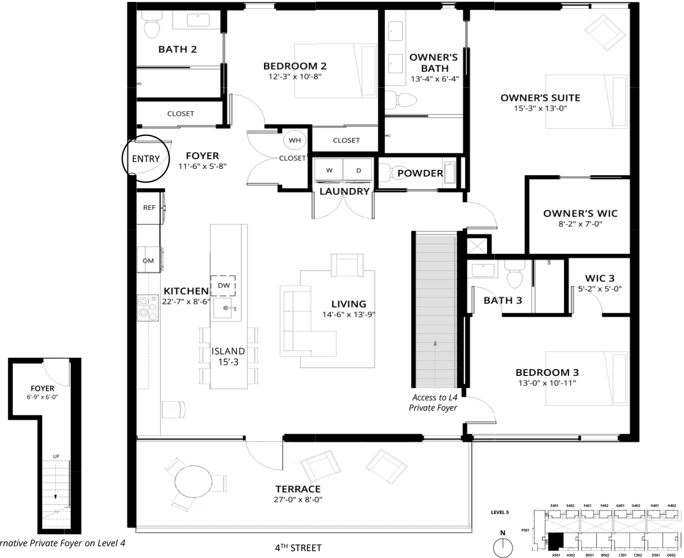
Alternative Private Foyer on Level 4

THE GALLERY'S PICTURESQUE CENTER COURTYARD