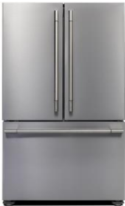
36" CABINET DEPTH REFRIGERATOR FREEZER