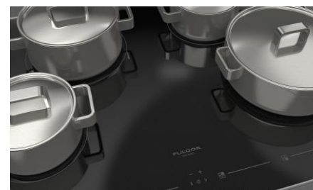
30" INDUCTION COOKTOP – 4 BURNER