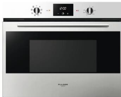
30" WALL OVEN