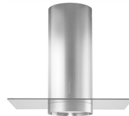
Optional Upgrade – Add $500 15" COOKTOP WALL HOOD